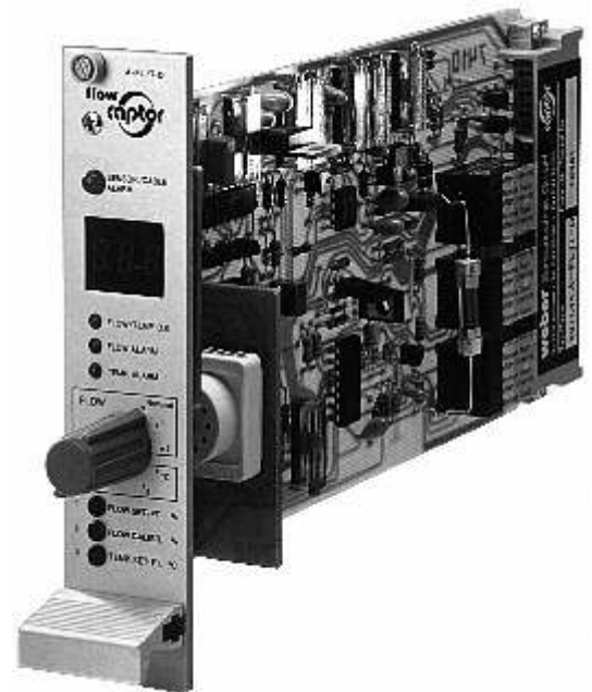
flow-captor eurocard for 19" rack mounting

Typical applications are found wherever cooling and lubrication systems require accurate and reliable measurement, e.g. oven cooling systems in the steel industry, in raw material productions or in power stations.